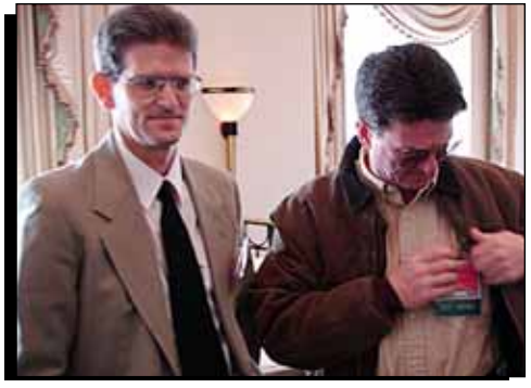
Part 1 of 2...