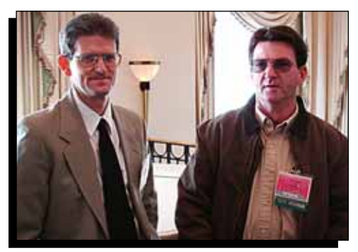
I'm so happy he finally got that name tag on.