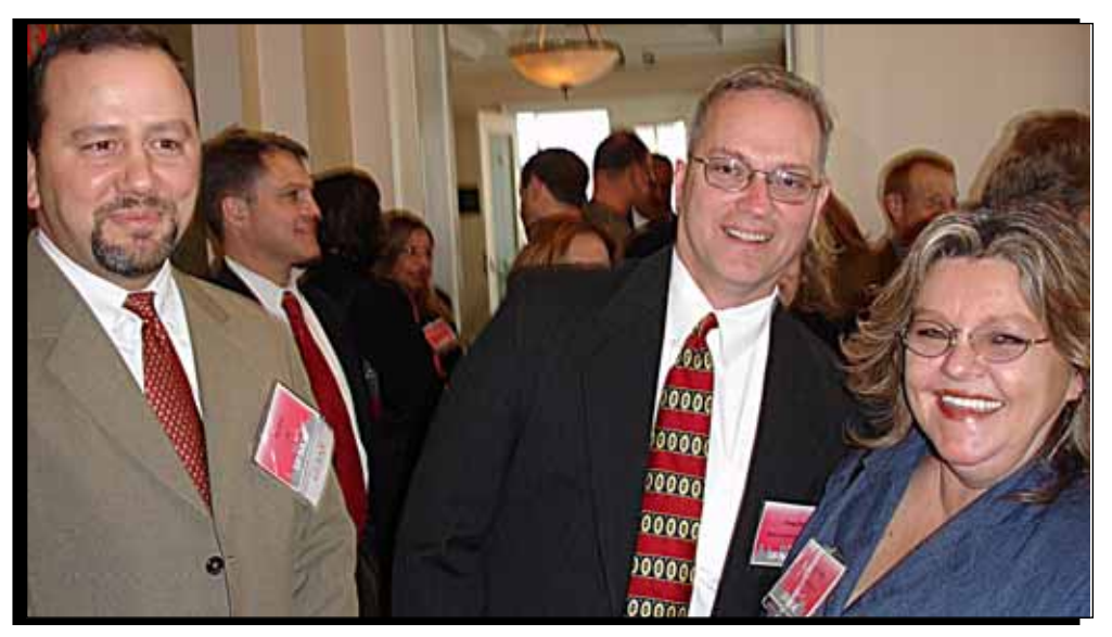
Is this room tilting to the left or is it just me?