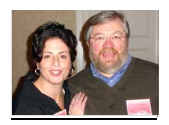
So glad to see you!